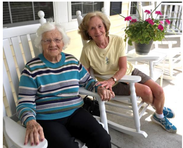
A summer day on the front porch of Carillon in Cramerton.