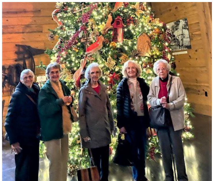
CELC friends enjoying a day at the Billy Graham Library